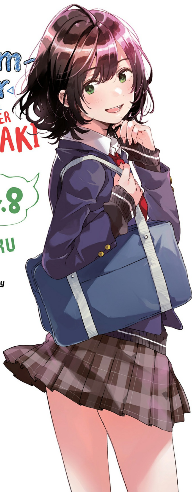
Illustration by Fly